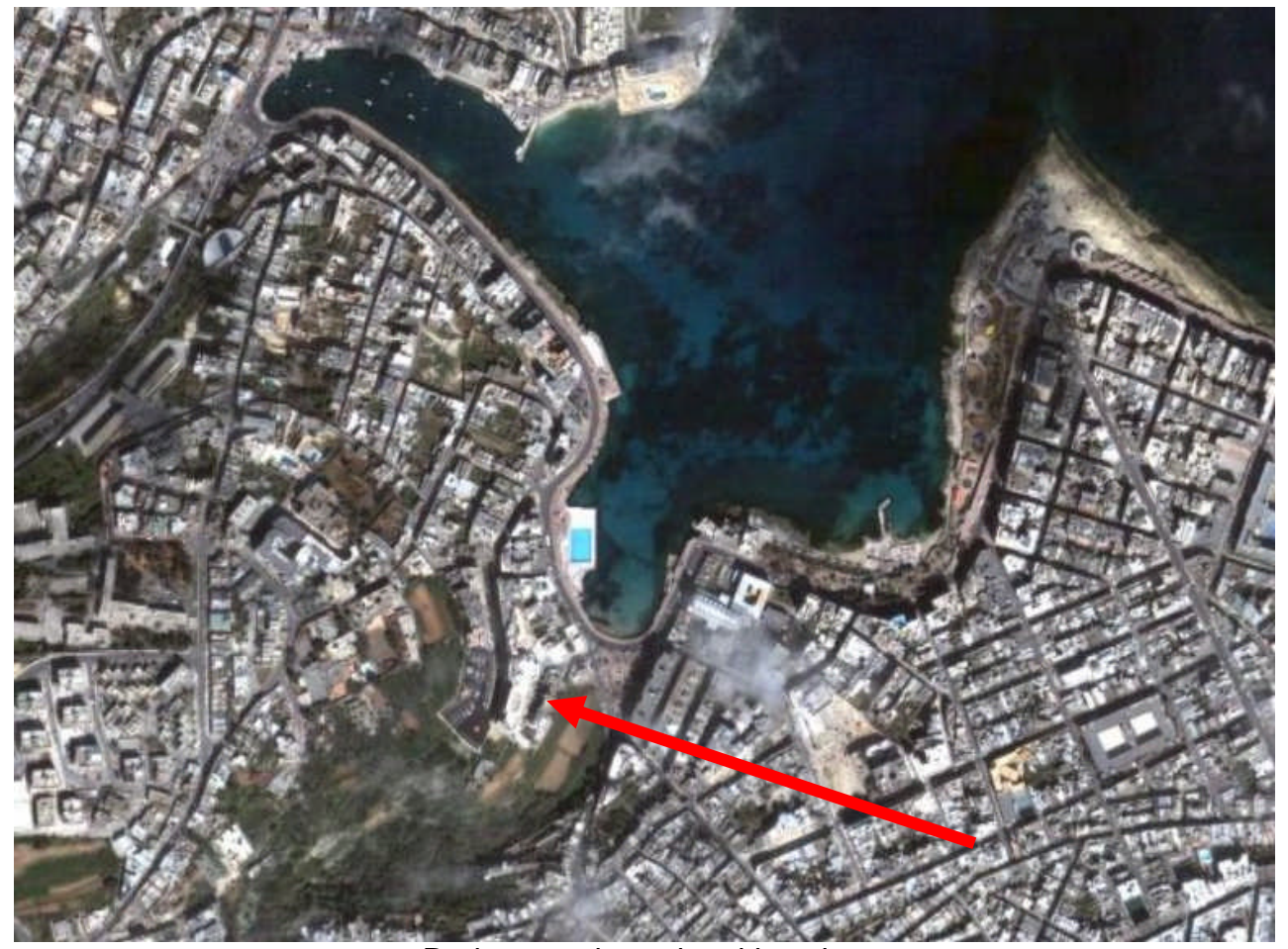
Red arrow shows hotel location

The Maltese language (Malti) is in the Semitic family (which includes Hebrew and Arabic) but English is almost universally spoken and is one of the two official languages. Note that \docume{g} and \docume{z} are 'soft' versions of \docume{g} and z, and h is silent except when written as h. gh is silent, but lengthens the preceding or following vowel, and q is a glottal stop.