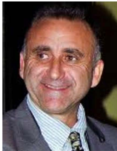
Edmundo Tovar Education Society