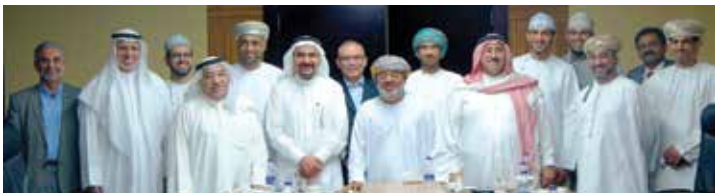
Members of the Conference and Exhibition steering and organising committee from Oman and other GCC states

OMAN'S capital Muscat was the venue for the 8th biennial IEEE GCC Conference and Exhibition, hosted at Sultan Qaboos University on 1–4 February 2015.