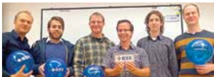
Ideas were ballooning at BME last year

This event was the first meeting of Young Professionals in Hungary.