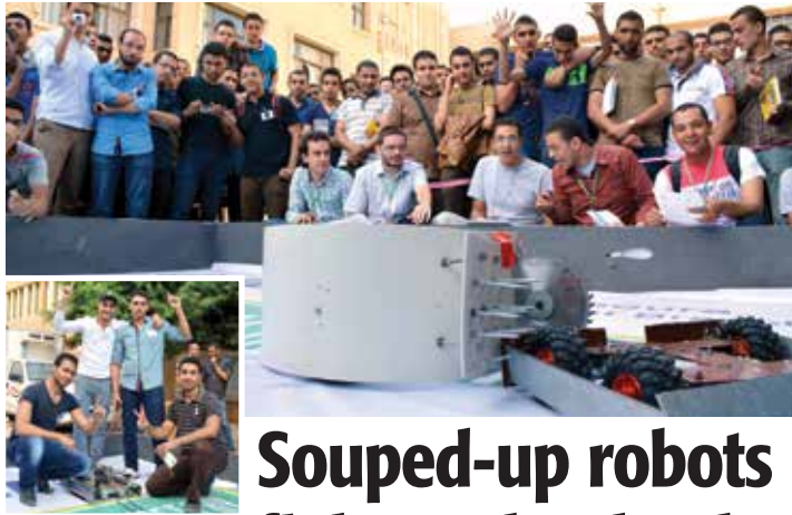
The winning team with their robot