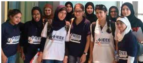
QI-IEEE-SB students attending the QMIC field trip