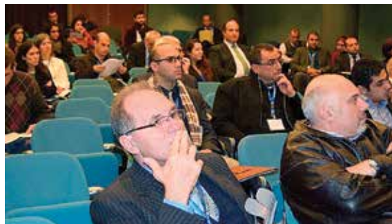
Attendees were treated to four keynote lectures in Beirut, Lebanon