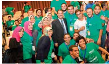
Egypt Section chair with the YP Volunteers in green