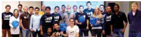
Evaluations revealed that many were unaware of the programs and tools for YPs

NORWAY Section established its Young Professionals Affinity Group in June 2014. Its first goal was to create awareness. To do that, a STEP event titled 'Opportunities for Young Professionals in IEEE' took place on 7 October in Trondheim at NTNU, the main university for higher education in engineering and technology in Norway.