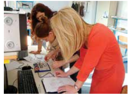
University of Sarajevo Student Branch PES Chapter